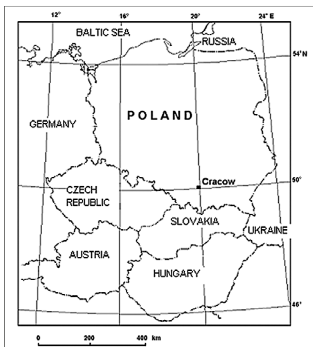
Figure 1. Study site localization

Pollen data were collected in Cracow using the volumetric method recommended by the European Aerobiology Society