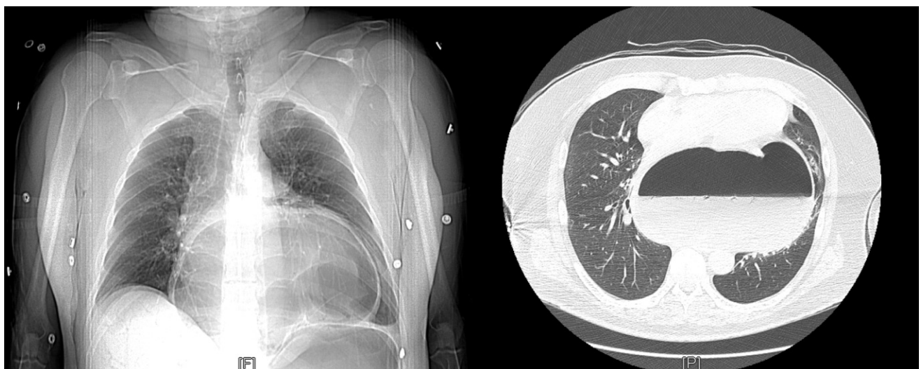
Figure 2. Chest CT scans showing giant hiatal hernia causing massive compression of the heart

Tension gastrothorax is a rare and life-threatening condition, which causes contralateral shift and compression of the mediastinal structures by translocation of the stomach into the chest cavity [8, 9]. It is usually associated with congenital diaphragmatic hernia in children, or occurs due to diaphragmatic injury as a result of trauma or complication